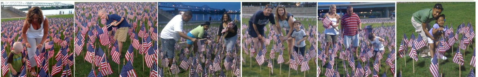
This is a lady with her children taking a photograph.