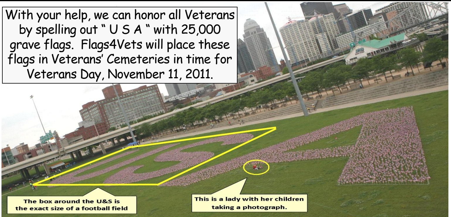
The box around the U&S is the exact size of a football field

With your help, we can honor all Veterans by spelling out "U S A" with 25,000 grave flags. Flags4Vets will place these flags in Veterans' Cemeteries in time for Veterans Day, November 11, 2011.